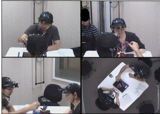
Figure 1. Video recording from four directions

Two health social professionals then evaluated social competence based on observations of the practical assessment using the IRSA impression items. The means of the six subscale impression scores were calculated.