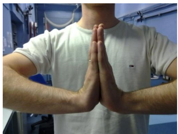
Figure 1. Reverse Phalen's manoeuvre

when completing push ups with hands on a vibrating platform, therefore increases the relative risk. This risk can again be exaggerated if the hands also receive impact e.g. during plyometric press ups, potentially leading to a debilitating condition of the ulnar nerve known as hypothenar hammer syndrome[21]. The Ulnar nerve is not the only nerve at risk during vibration exercise. During push ups participants are required to place their hands directly upon the platform in a position similar to that of the 'provocative positions' which are positions which exacerbate symptoms used in the clinical diagnosis. Examples of provocative positions in carpal tunnel syndrome are the "reverse Phalen's manoeuvre" (see Figure 1)