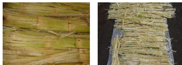
Figure 3. Material treated in water and sun dried for preliminary drying

The bagasse is submersed in room temperature water to