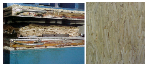
Figure 6. Long particles in Marconi MA-98/50 hydraulic press and definitive panel

From preparation time to particle orientation, it takes 12 to 15 minutes, initial reaction time of resin or gel time of mammon based resin. After orientation, the long particles are pre-pressed aiming to uniformly distribute layer compaction and then are subjected to 90°C temperature to be pressed for 10 minutes in a hydraulic type press brand Marconi MA-98/50, Figure 6. This temperature is responsible for acceleration of the resin cure and accountable for thermal standards of the cane bagasse.