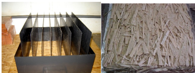
Figure 5. Large particle orienter developed in LaMEM-SET and layers of oriented particles of cane bagasse

Subsequent to the resin application, the long particles were placed in a particle orienter to divide the layers. Such layers are divided in external and internal layers. The external layers imperatively have the same orientation, while the internal ones can be oriented or not, as illustrated in Figure 5.