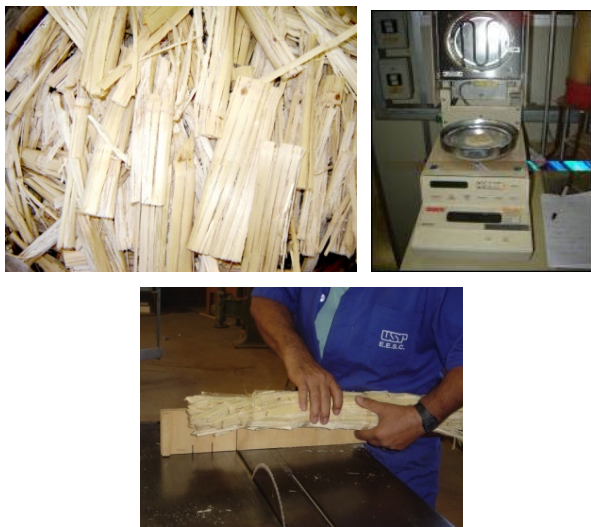
Figure 4. Bagasse after being dried in heater, test equipment, solid percentage and slicing of sugar cane bagasse

The artificial drying process is done in heater for 16 hours at 60°C temperature, where it is checked for possible anomalies, since above this temperature there is water loss that could cause disequilibrium to its basic structural form. Immediately after treatment and drying it is prepared for particulate obtainment by cutting (Figure 4) it to mean length of 14cm.