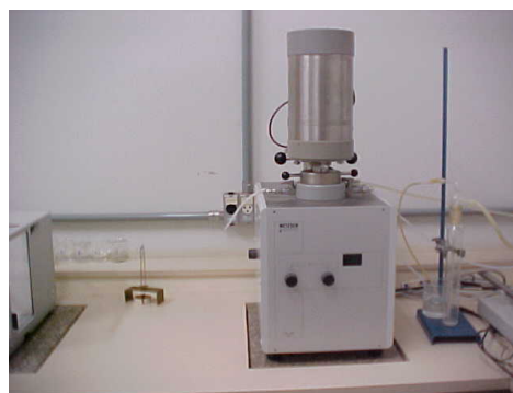
Figure 2. NETZSCH Equipment, model STA 409 Cell-Thermogravimetric analysis

A simultaneous thermal balance TG-DTA, brand NETZSCH, model STA 409 Cell (Figure 2) was employed for this analysis, with a heating rate of 10°C/min. owing to the fact that this heating ratio promotes a better resolution curve standard in nitrogen atmosphere.