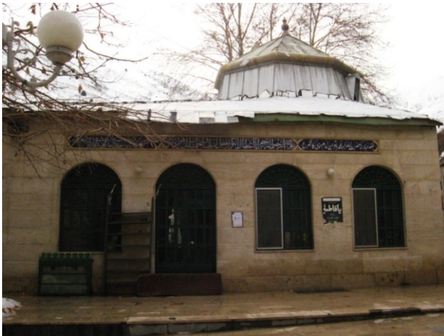
Plate 6. Imamzade Mohammad Bagher Roudak

This monument is situated on the southern end (upper part) of the village and in the western angle of Ziarat valley in geographical location of 35 degrees, 50 minutes, and 49.1 seconds of latitude and 51 degrees, 32 minutes and 51.8 seconds of longitude and at the height of 1869 meters above sea level. Apparently, the main materials of the building consist of rubble and traditional mortar of stucco. Today, all parts of the building including interior and exterior parts are covered with new materials (pl. 6).