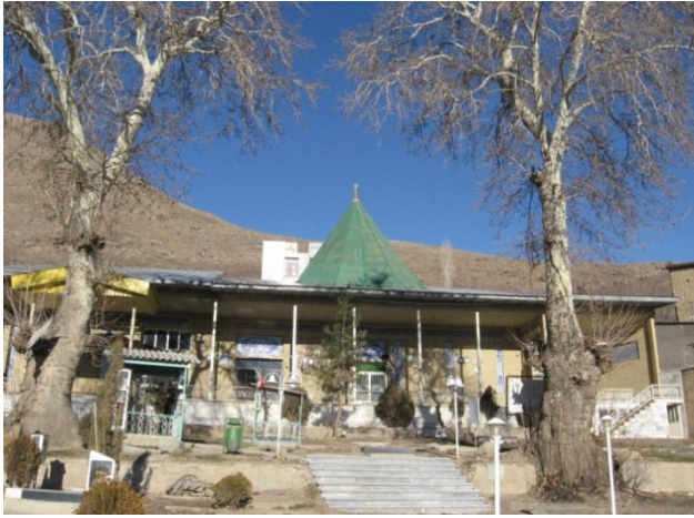
Plate 12. Imamzade Khajeh Soltan Ahmad