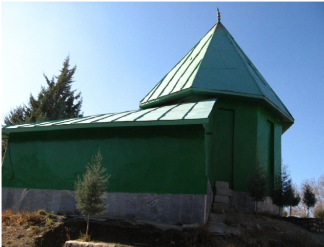
Plate 10. Imamzade Tayyeb e Rassanān

Is situated at the center of the village and besides a hill which is called Dezvareh hill by the indigenous people. On some graves existing beside the shrine, Dezvarei surname is observed. Its geographical location includes: an latitude of 35 degrees, 48 minutes, and 11.3 seconds and a longitude of 51 degrees, 45 minutes and 23.1 seconds and height of 1945 meters from the sea level. The main materials of the building include stone and mortar and materials of the joint building consist of brick and cement (pl. 10).