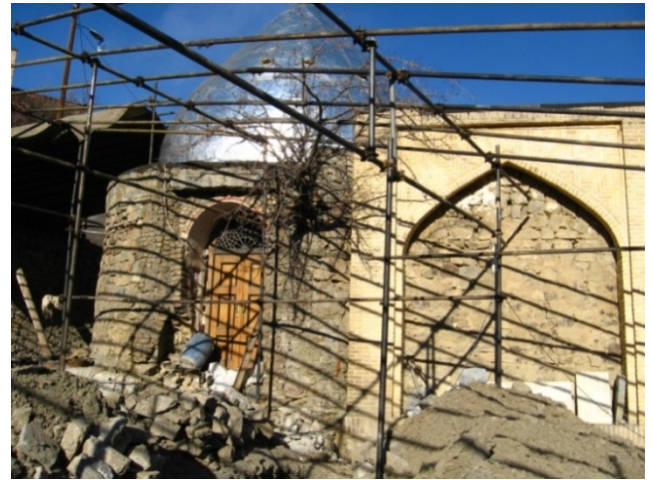
Plate 3. Imamzade Ibrahim Abnik

This offspring of Imam (Imamzadeh) is located at the northwest of Abnik village and in the western side of Kalaroud River and its geographical location is as follows: at latitude of 35 degrees, 59 minutes, and 22.9 seconds and longitude of 51degrees, 36 minutes and 7.59 seconds and height of 2450 meters above sea level. Imamzadeh is situated at the northwestern part of the village. The main materials of the building consist of rubble with stucco and clay mortar which are completely apparent from outside (pl. 3).