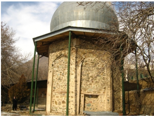
Plate 13. Imamzade Younes