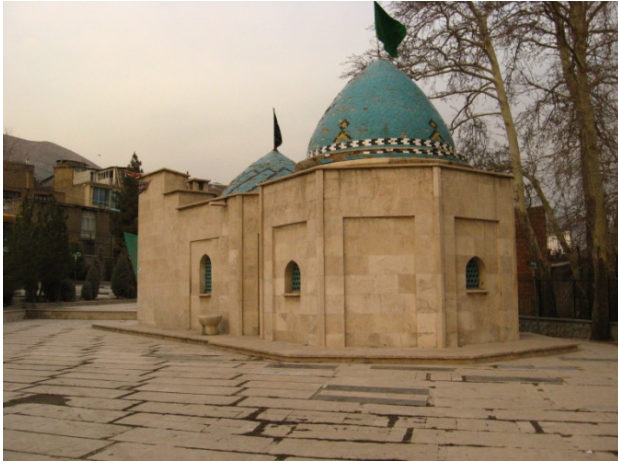
Plate 1. Imam Zadeh Abdollah, Jaeij, Lavassan town