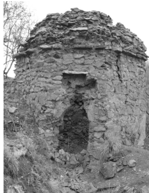
Plate 8. Imamzade Khosro Nasser Abad

Is located on about 1.5 km from northwest of Nasser Abad and in an area called Igeh. It is located in the eastern part of a valley, where the river flows. Its geographical location is: latitude of 35 degrees, 52 minutes and 42.9 seconds and a longitude of 51 degrees, 37 minutes and 50.4 seconds and height of 2096 meters above the sea level. Materials of the building consist of rubble and traditional stucco mortar (pl. 8).