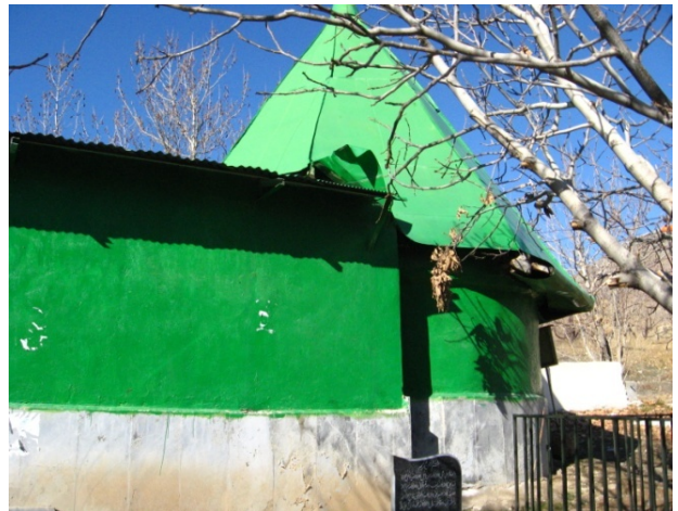
Plate 11. Imamzade Fazl and Fazel e Chahar Bagh