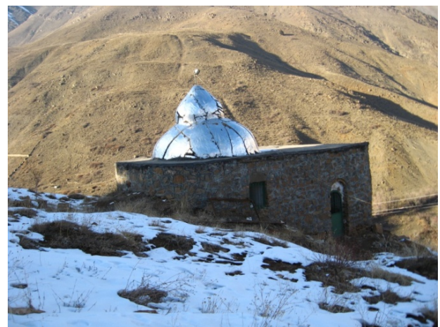
Plate 4. Imamzade Tayyeb Abnik

Its geographical location is: latitude of 35 degrees, 59 minutes and 16.1 seconds and longitude of 51 degrees, 36 minutes and 55.9 seconds (pl. 4).