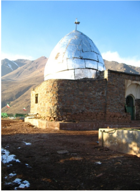
Plate 5. Imamzade Mousa Abnik