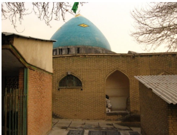
Plate 2. Imamzade FazAli e Nārān, Lavassan town