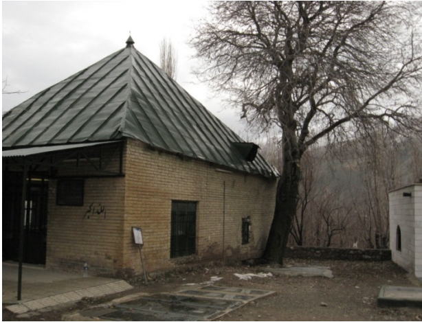
Plate 9. Imamzade Mohammad and Abdollah Boujan

shrine have been originally consisted of stone and stucco mortar and during later periods it has been covered with bricks (pl. 9).