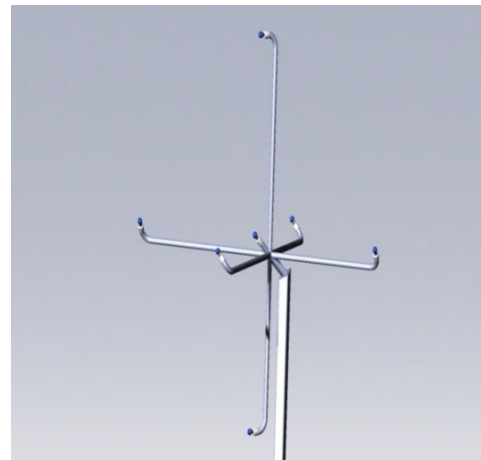
Figure 3. Illustration: Antenna of acoustic direction finder. This antenna made with three bases, their central sensor is common

The principle of the conjugated delays method is simple, the first step consisting of measuring, independently the instant of emission, the signal arrival time on each antenna sensor with respect to the system's temporal reference. The other information (antenna geometry and propagation speed) is already known.