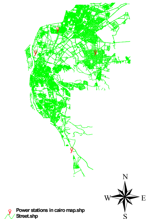
Figure 2. Power stations in Cairo

Power Stations were in four areas in Cairo (El Zawia, Al Sabtia, Naser city, Wadi hof).