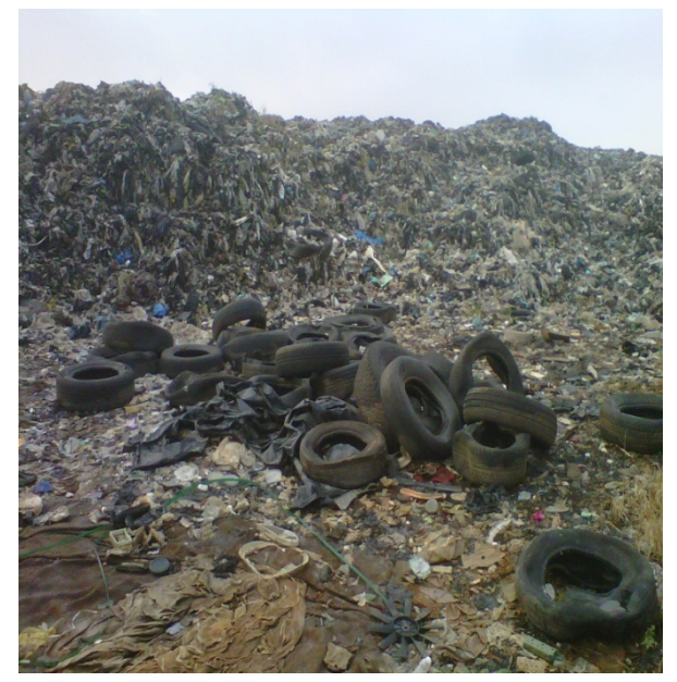
Figure 4. Scraptyres on Soluos (2), february 2012