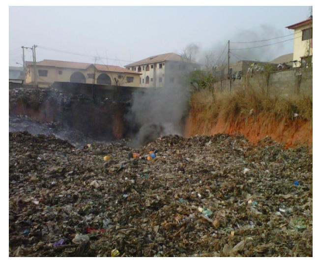
Figure 6. Smoke from fire involving tyres on Soluos (2) drifting to nearby homes, 2012

A common cause of these landfill fires is spontaneous combustion. This results from an increase in the oxygen content of the landfill, which increases bacterial activity and raises temperatures (aerobic decomposition). These so-called "hot spots" can come into contact with pockets of methane gas and result in a fire. This can be identified when white or brown smoke emanates from some part the of the landfill surface[24]. The heat from the fire can cause chemi cals to volatilize or breakdown and enter the environment through the smoke. Burning tyres emit dioxins [20],[8] which can cause cancer and reproductive impairment at extremely low levels[21].