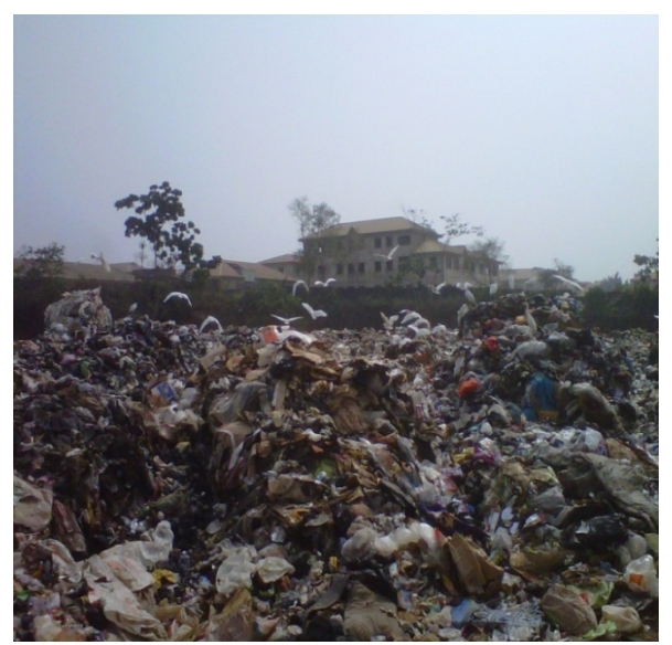
Figure 3. Cattle egrets for aging on Soluos (1) landfill, 2012

The abundance of waste tyres on the sites (Figure 4.) is also a serious concern. Tyres are ideal sites for rodents and also breeding sites for mosquitoes that transmit malaria, dengue and yellow fever. The round shape of tyres, coupled with their impermeability, enables them to hold water and other debris (decaying leaves) for long period of time, turning them into perfect sites for the development of mosquito larvae[19]. Salmonellosis, ornithosis, rat bite fever, leptospirosis, and eastern aquine encephalitis are among some of the important vermin diseases that affect humans [15].