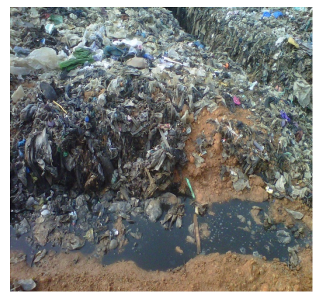
Figure 5. Leachate collects at the base of a waste cell on Soluos (3), 2012

Leachate is a high-strength wastewater formed as a result of percolation of rain-water and moisture through waste in landfills[12]. Municipal landfill leachate are highly concentrated complex effluents which contain dissolved organic matters; inorganic compounds such as ammonium, calcium, magnesium, sodium, potassium, iron, sulphates, chlorides and heavy metals such as cadmium, chromium, copper, lead, zinc, nickel; and xenobiotic organic substances [13],[5].